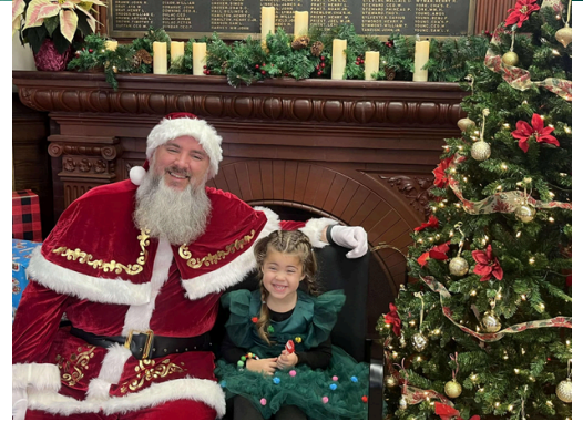
A photo of one of our most special guests last year! Santa!

We are excited for new programs as well as the return of patron favorites, in the Children's Department for the 2025 year. We will be adding more dates for Makers Club and another Sewing Club. We are also currently interviewing Volunteer Dungeon Masters for our Dungeons and Dragons Club. In addition, we have our weekly Storytime every Wednesday at 10:30 am, that has blossomed into a very tightknit group of families and their kiddos, including many homeschooling families